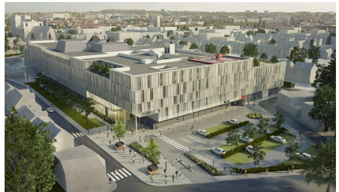
Figure 2 – Hospital complex in Abbeville (Somme), a typical configuration for UAV-based medical delivery service

The need for a better understanding of the turbulent atmospheric conditions leads to the development of significant experimental and numerical research efforts (e.g. Nithya et al. 2024). Numerical simulations on this topic are usually carried out with Large-Eddy Simulations (LES) method (e.g. Giersh et al. , 2022), due to its capacity to resolve unsteady phenomenon on part of the turbulence spectrum. At ONERA Lille, a PhD thesis was undertaken on the use of the LES meteorological code Meso-NH (developed by the French meteorological agency Météo-France, Auguste et al. , 2020) with the objective of reproducing turbulent wind conditions, and particularly extreme unsteady events, at a resolution close to UAVs typical scales with relevant turbulence inlet conditions. The introduction of obstacles representing built environment is achieved by Immersed Boundary Method (IBM), which is used to perform numerical simulation by a set of wall interaction laws from the solid domain to the fluid domain (without body-fitted meshing of the fluid domain). Currently, the type of obstacles considered consists of simple geometries such as parallelepipeds, immersed in a structured fluid domain mesh.